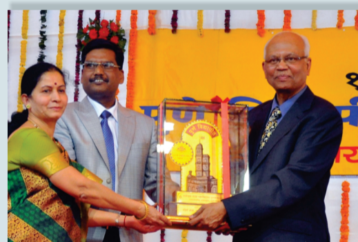
Best College Award, Savitribai Phule Pune University (2014)