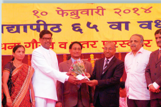
Jagannath Rathi Award (2014)