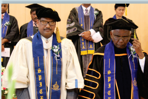
Chief guest for convocation program at Spicer Adventist University (2013)