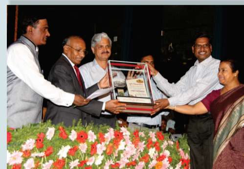
Best College Award, student welfare board, Savitribai Phule Pune University (2015)