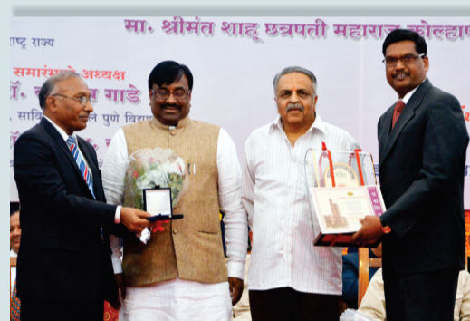
Best Principal Award (2015)